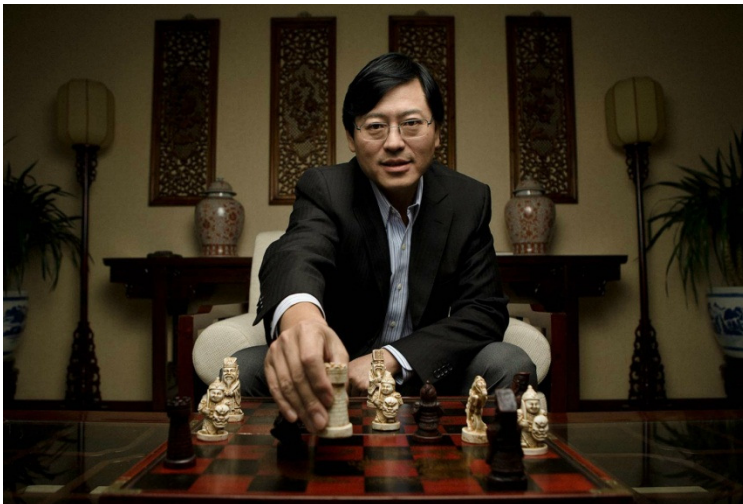
Lenovo CEO Yang Yuanqing making strategic moves