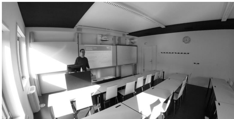
Fig. 2 Camera position at the side, with no readability of slides.

exist, such as proprietary applications from manufacturers, which need to be installed on mobile devices. Lecturers might disapprove of this, as it may interfere with their personal devices. The Ricoh Theta V is controllable via an API over USB through libptp2 5 , a library to control camera functions. For this purpose a prototype has been developed enabling a mobile ad hoc remote control via a web interface in order to explore this challenge. It incorporates a Raspberry Pi, a Wireless LAN USB adapter and a USB cable connected to the Ricoh Theta V. Simple remote control actions such as starting and stopping a recording were tested and confirmed functional via terminal commands. This web interface could replace proprietary applications and offer a flexible way to control and preview the camera via any browser interface.